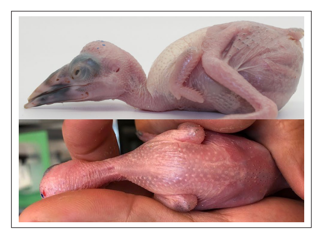
Figure 4. Lateral and dorsal views of a Von der Decken's hornbill chick, day 6 (score 3). More than half the back is covered by a pale and translucent air sac.

growth and behaviours (i.e. if they showed any signs of overheating or being cold, such as panting and shivering). It was sometimes difficult to score the air sacs from Day 8, as some were deflated for most of the day.