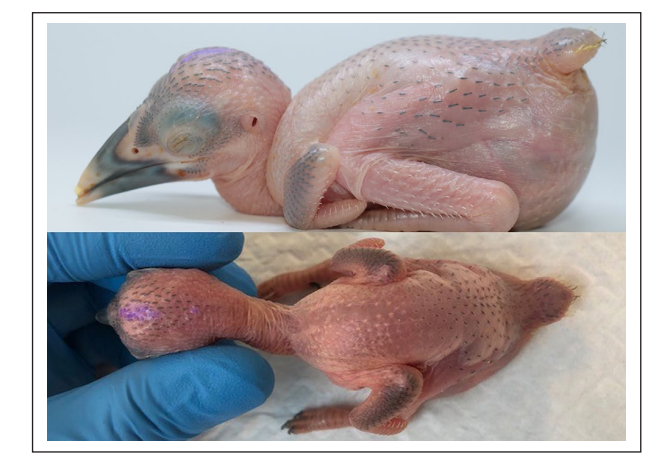
Figure 5. Lateral and dorsal views of a Von der Decken's hornbill chick, day 8 (score 4). The entire back is covered by a pale and translucent air sac, almost extending to the tail, and extending to the sides of the chest.