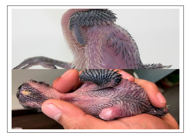
Figure 7. Lateral and dorsal views of a Von der Decken's hornbill chick, day 15 (score 5). The air sac has receded. Some loose skin is observed.

The air sac system is known to remain for longer periods in larger species, probably related to longer nestling periods,<sup>9</sup> and we found that this may also hold true for birds within the same genus. Wild Monteiro's hornbill ( T. deckenii ) chicks lose their air sacs by Day 20<sup>8</sup>; in comparison, the Von der Decken's hornbill chicks in this study lost theirs by Day 16.