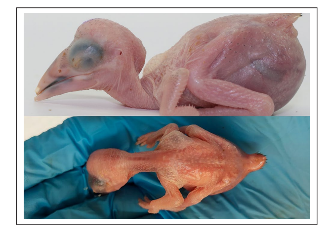
Figure 2. Lateral and dorsal views of a Von der Decken's hornbill chick, day 2 (score 1). There are two distinct pale, translucent air sacs over the shoulders, separated by the spine.