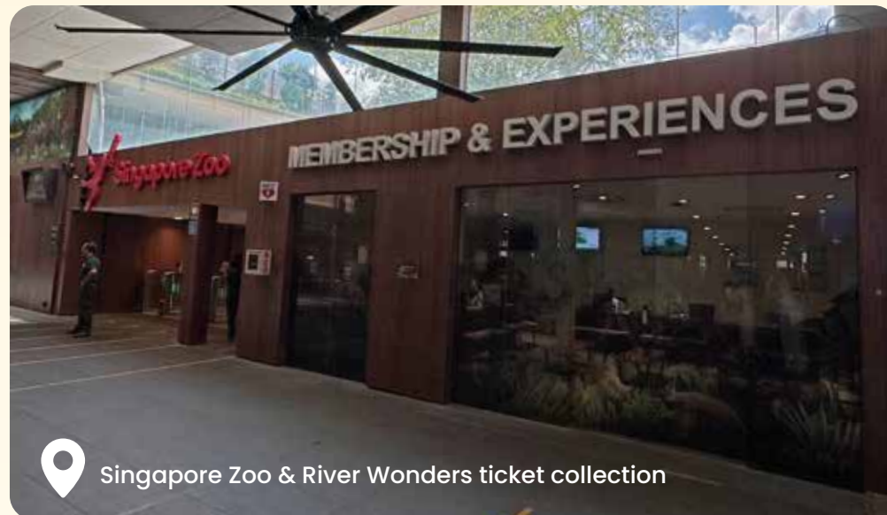
Singapore Zoo & River Wonders ticket collection

Download the Mandai app to plan your visit or view maps on mobile.