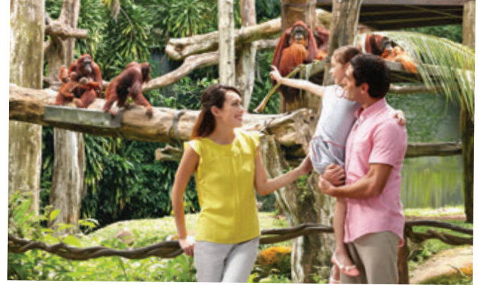
Free-ranging Orangutan Island