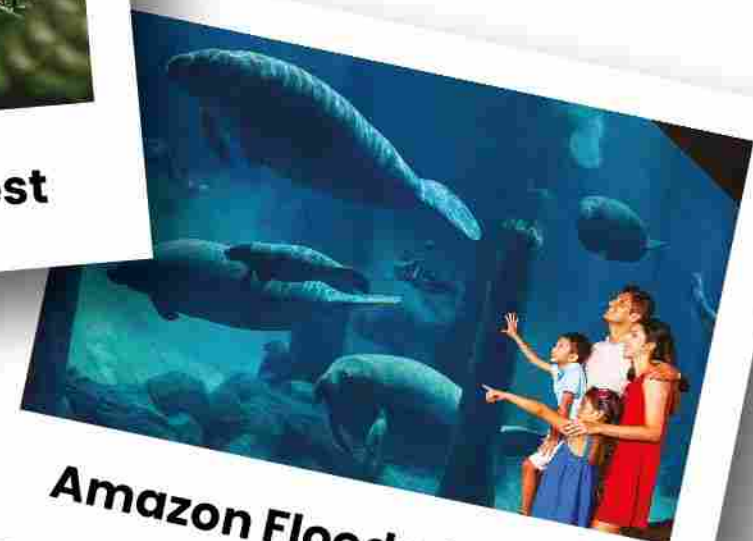
Amazon Flooded Forest