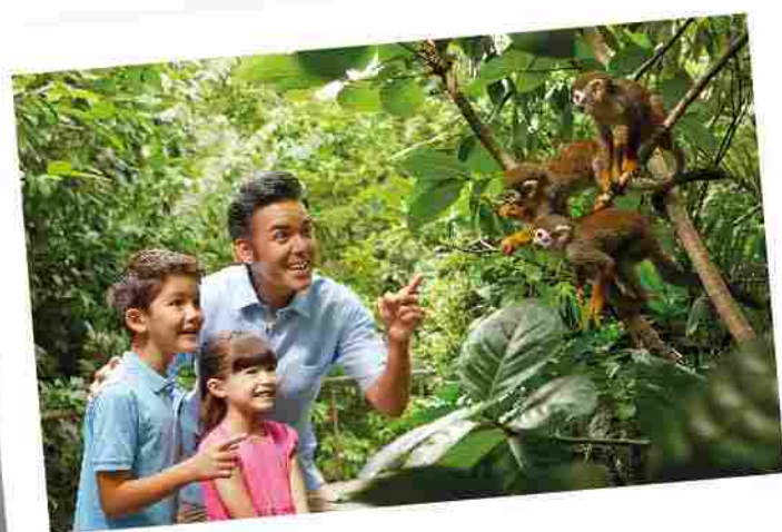
Squirrel Monkey Forest