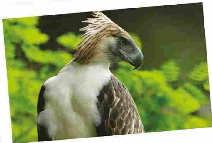
Birds of Prey